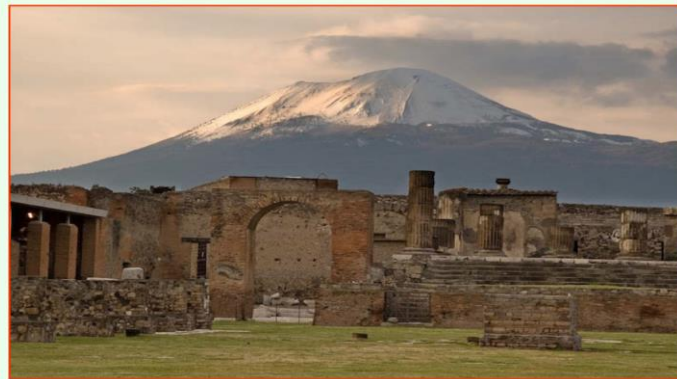
These are the ruins of the Roman city of Pompeii. Mount Vesuvius looms in the background.