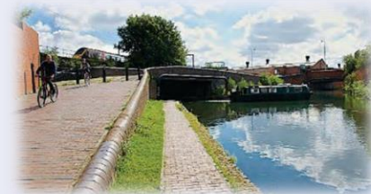
Wolverhampton to Birmingham canal

Boats can travel on the canals around Bilston. You can walk along the tow path.