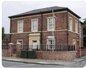
Bilston Police Station