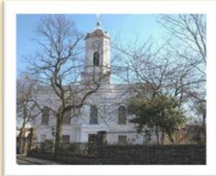
St Leonard's Church