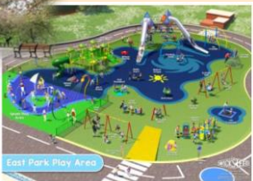
The amazing new look for East Park showing the layout of the new play area