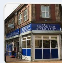
Major's Chip Shop