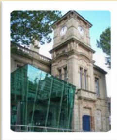
Bilston Town Hall