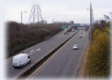
The Black Country Route

This is a busy road that links Bilston to the motorway and other towns and cities.