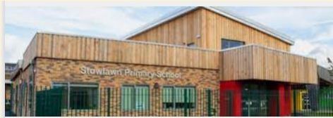
Stowlawn Primary School