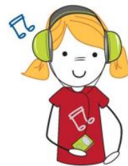
J'écoute de la musique.