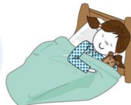
Je me couche.