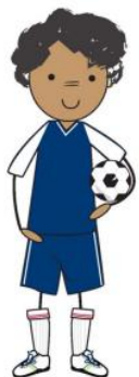
Je joue au foot.