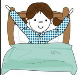
Je me lève.