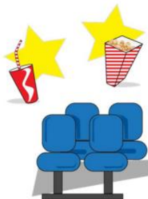
Je vais au cinema.