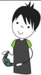
Je joue à l'ordinateur.