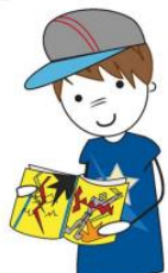
Je lis des bandes dessinées.