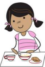
Je prends mon petit-déjeuner.