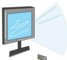
Je regarde la télé.