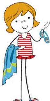
Je vais à la piscine.