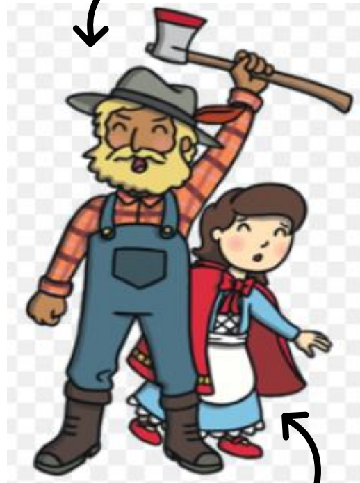
petite chaperon rouge